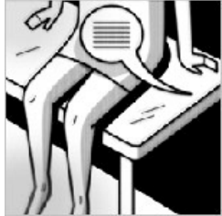
Liptak: State's Words, Doctor's Mouth