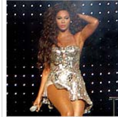
Music Review: Beyoncé