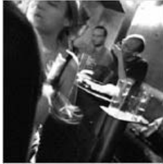
You, Your Friends, Your Friends of Friends