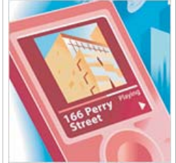
Selling a Condo With a Song

Home | World | U.S. | N.Y. / Region | Business | Technology | Science | Health | Sports | Opinion | Arts | Style | Travel | Jobs | Real Estate | Automobiles | Back to Top