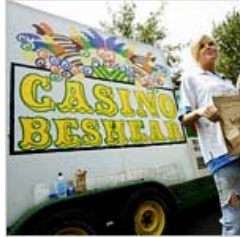
Kentucky Politics and Ribs